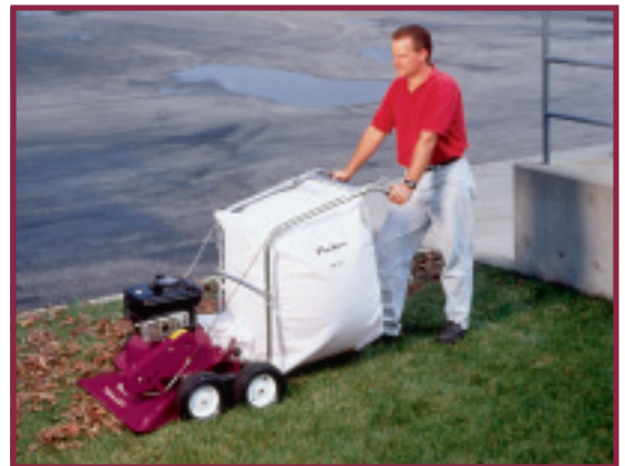
Excellent for Turf and Hard Surface Cleaning