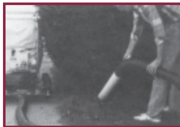
Optional Hose Attachment Shown